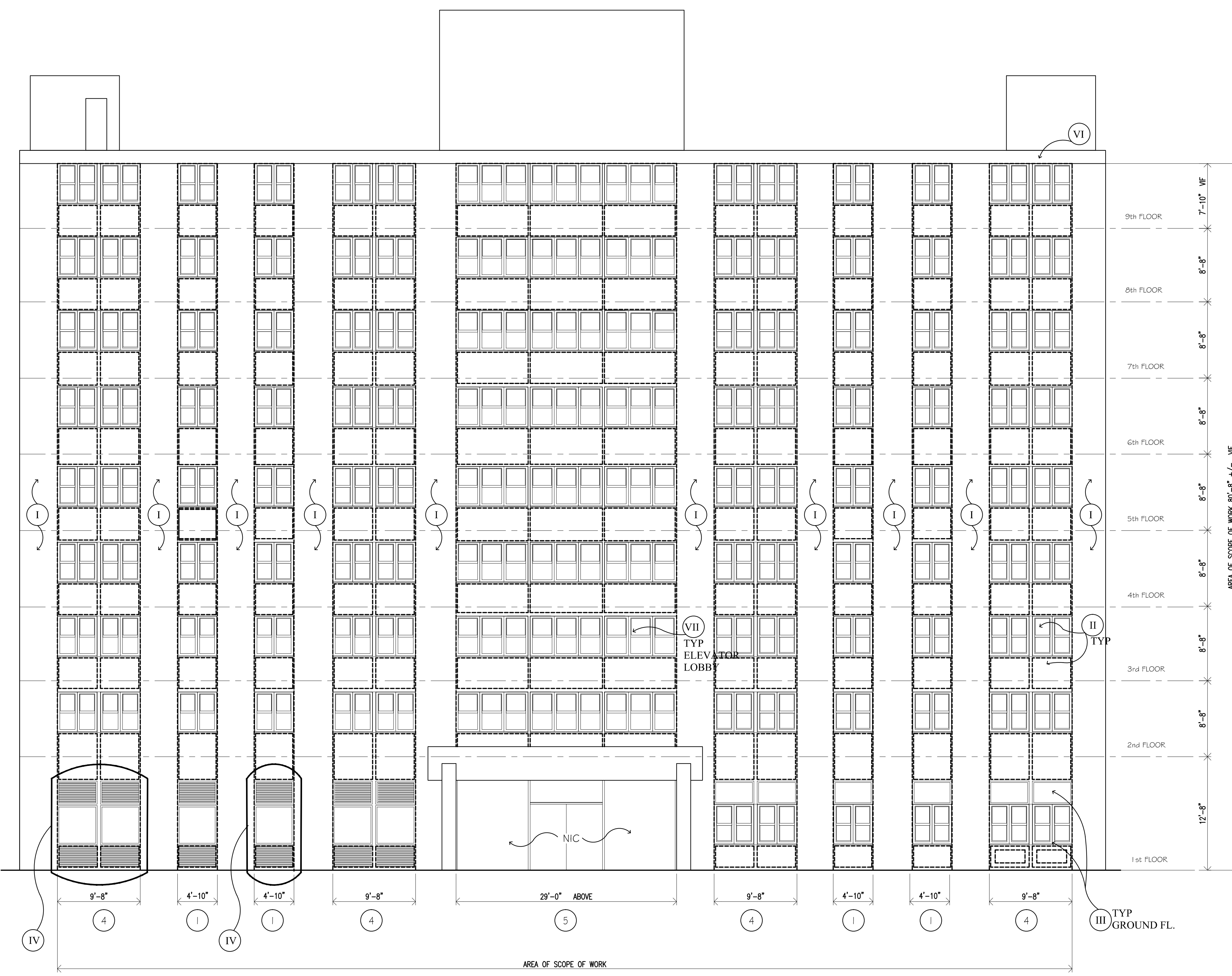
1 FRONT ELEVATION - 140 N. MAIN AVE. NTS.

THIS DRAWING AND INFORMATION CONTAINED HEREIN ARE THE PROPERTY OF CRESTINA BUENDICHO ARCHITECT AND NO PART OF THIS DRAWING OR INFORMATION SHALL BE REPRODUCED OR TRANSMITTED IN ANY FORM OR BY ANY MEANS WITHOUT THE WRITTEN PERMISSION OF CRESTINA BUENDICHO ARCHITECT. Registered Architect: Cristina Buendicho, AIA NJ License No. 12978